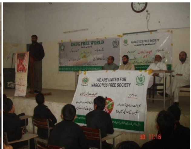
Lecture at Govt High School For Boys Hayat Abad Peshawar - 30 th Apr