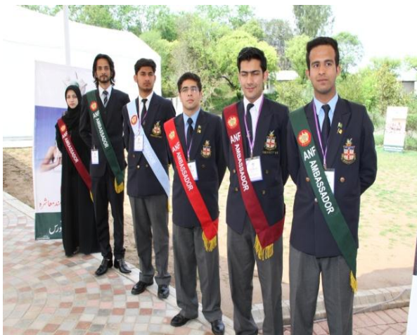
Youth Ambassadors at venue reception