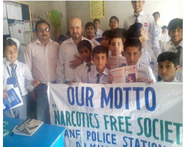
Lecture at The Keystone Scholl Bijli Ghar D.I.Khan - 29 th Apr