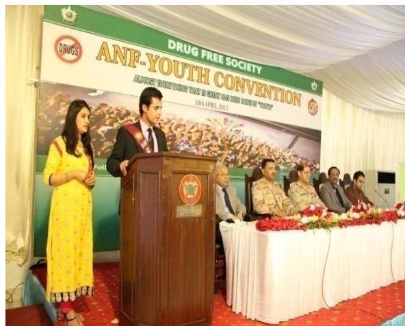
Youth representatives presenting opening remarks