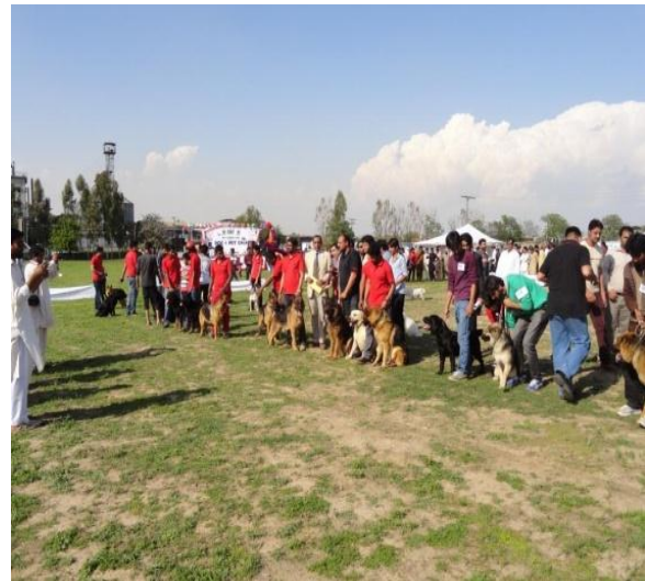
Participants of Dog & Pet Gala - 5 th Apr

The event included open invitation for pet-lovers, family-outing, music-followers and food-fans, which was overwhelmingly attended by walk-in families, youth, students, pet lovers etc. ANF sniffing dogs presented a live demonstration for detection of narcotics in a vehicle. Acrobat show, singers performance, live-prototypes of Mr. Been and different cartoons were made part for children's interest. The event concluded with the prize distribution ceremony with awards to best veteran, best cross breed, best rescue dog, most handsome dog, prettiest dog, most appealing eyes and junior most handler. In addition, appreciation prizes and certificates were also awarded to performers and organizers. DG ANF while addressing the event, emphasized to organize healthy activities in the society, for giving a way out to youth from social evils.