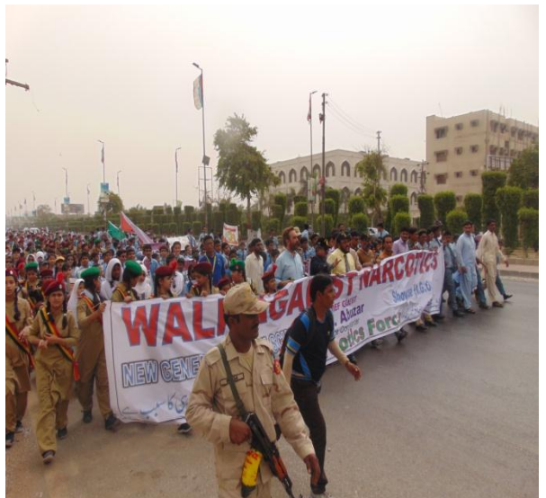
Walk organized at Karimabad Bridge to Ayesha Manzil, Karachi - 27 th Apr 15