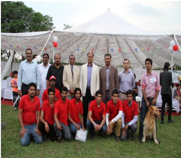
DG ANF with participants -5 th Apr