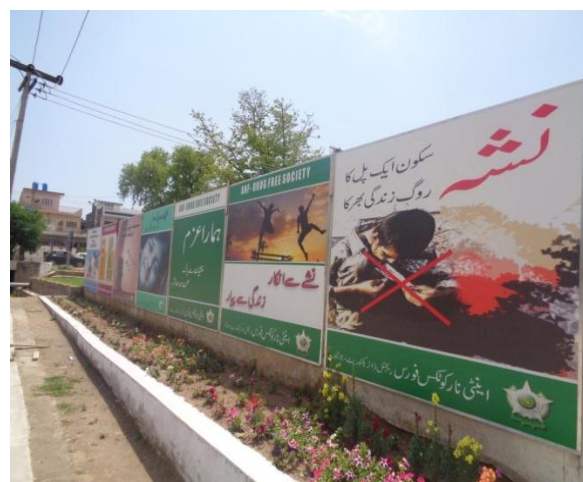
Awareness through hoardings & banners – April 2015