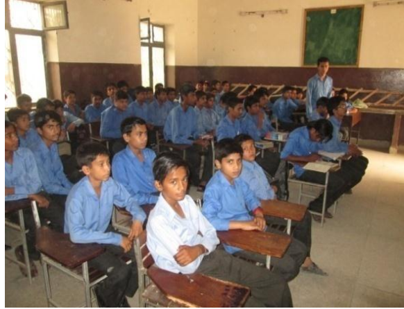
Lecture at Govt. Boys High School Mughal Pura, Lahore - 20 th Apr