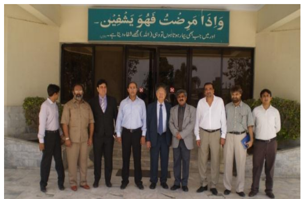
Donors Visiting MATReC, Karachi – 30 th Apr