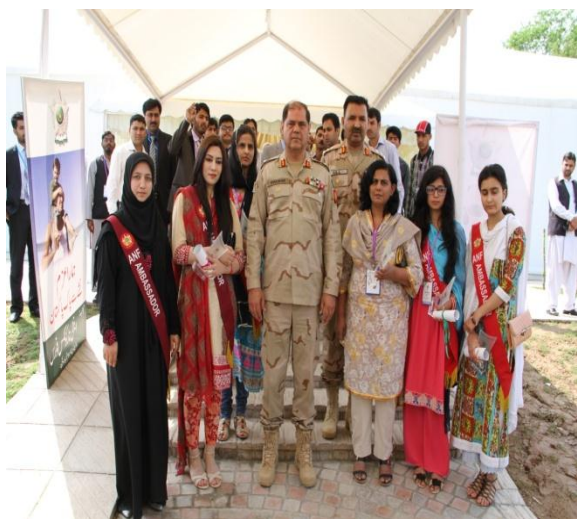
Youth Ambassadors Group Photo with DG ANF - 5 th Apr