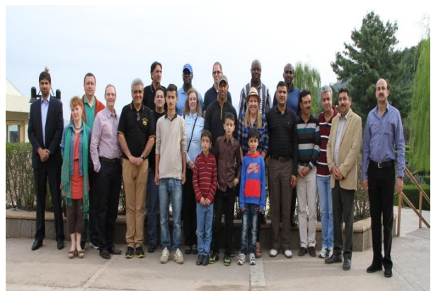
DLOs with ANF Officials at Murree