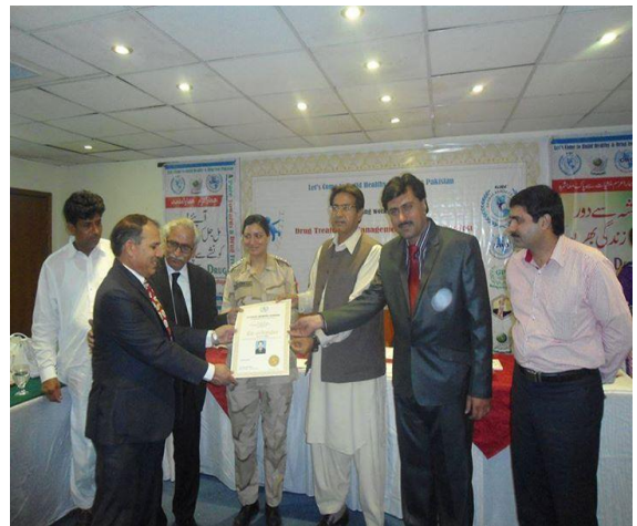
Training Workshop at Ambassaber Hotel, Lahore - 25 th Apr