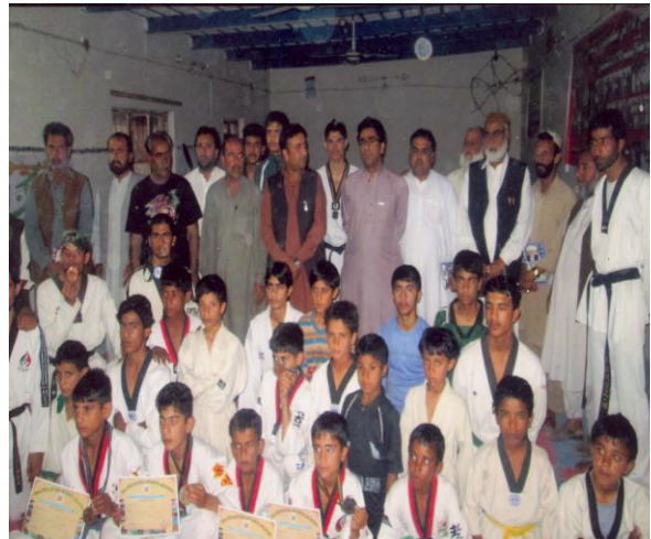
Taekawando Tournament organized at Shaheed Attaullah Notezai Taekawando Club, Dalbandin , Quetta - 11 th Apr