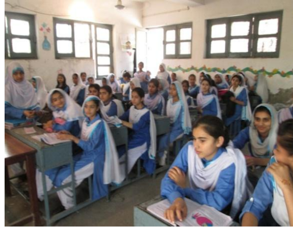
Lecture held at Govt. Girls High Sec School Singh Pura Lahore - 23 rd Apr